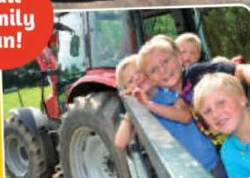
Full family fun!