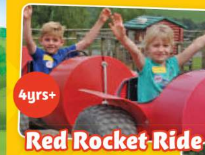
4yrs+ Red Rocket Ride