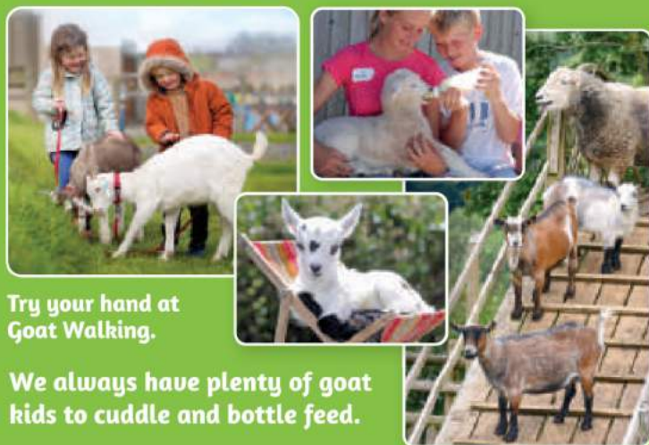
Try your hand at Goat Walking.

Toggenburgs, Anglo Nubien, Pygmy, Boer, British Alpine, Saanen, Golden Guernsey, Angora ... meet goats galore on the farm and in our Goatarama.